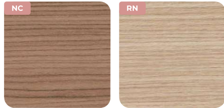
noce canaletto canaletto walnut noyer canaletto Canaletto Nussbaum nogal canaletto